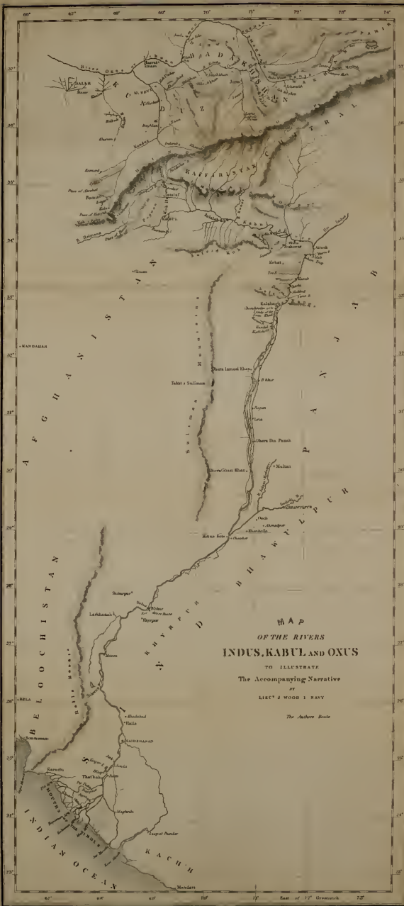
MAP OF THE RIVERS INDUS, KABUL AND OXUS TO ILLUSTRATE The Accompanying Narrative BY LIEUT. J. WOOD I. NAVY The Author Esq.